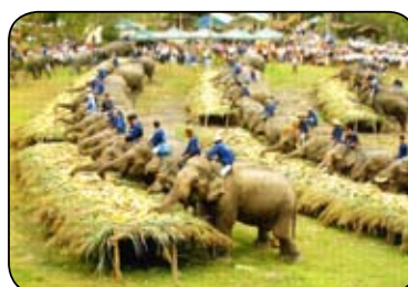
... Down Memory Lane: I visited the Elephant Camp in Chiang Mai, Thailand when I did some training there.