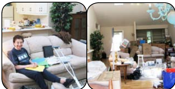
Packing to move isn't easy, particularly with a fractured foot!

My real estate agents in Black Mountain currently have my house there listed as a "short sale" – while this is going on, I will not be making payments. When there is an offer, there are two attorneys who will try to work out the details with the mortgage company. Your prayers are needed for this as well.